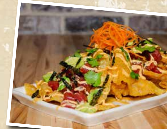
TUNA POKE NACHOS

ASIAN MARINATED CHICKEN, STIR-FRIED BELL PEPPERS, GREEN ONIONS, CILANTRO, GARLIC, SHREDDED CARROTS, RICE NOODLES, WATER CHESTNUTS, LETTUCE CUPS, PONZU SAUCE, SWEET CHILI AIOLI 12