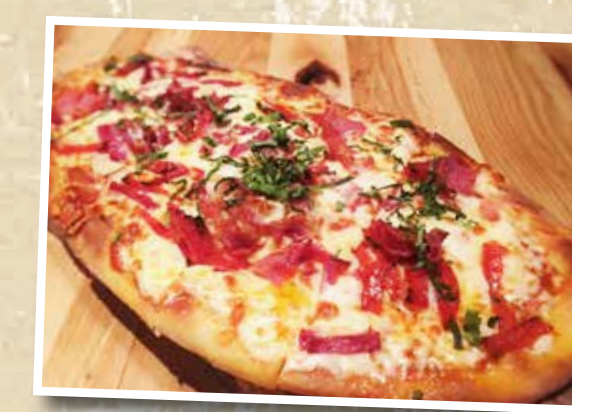
MEATLOVERS ITALIANO PIZZA

SHIITAKE MUSHROOMS, RED ONIONS, ROASTED PEPPERS, ROASTED ROMA TOMATOES, OLIVES, ARTICHOKES, ITALIAN CHEESE BLEND, FETA, PESTO SAUCE 11